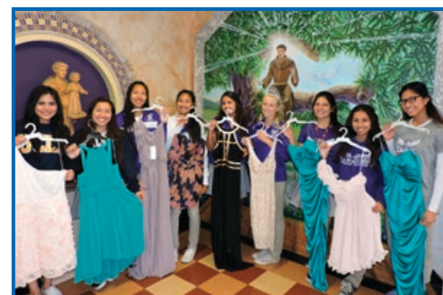
Catholic Charities Community Center helped prepare the girls for one of the most memorable times of their lives.

Elizabeth Ann Seton Residence has donations coming in daily. However, keeping so many things organized can be a task in itself. The Eagle Scouts built a Donation Station at Elizabeth Ann Seton Residence. The large cubby hole shelving has heavy duty plastic bins that are labeled and can efficiently and neatly store clothing and other donations.