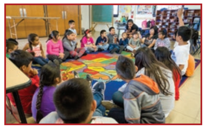
Good Shepherd Center for Homeless Women and Children (GSC) added a full-time Children's Program Coordinator at GSC's Women's Village. She developed services which were age-appropriate for youngsters and teens while their mothers were in job training, Life Skills classes or job development workshops.

VISION STATEMENT – Through the power of the Holy Spirit, Catholic Charities of Los Angeles commits to serve the vulnerable and to strive for a just society.