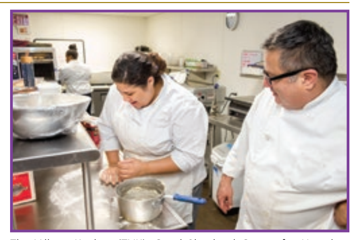
The Village Kitchen (TVK), Good Shepherd Center for Homeless Women and Children's onsite culinary arts 12-week, hands-on training program, taught basic cooking and baking techniques, as well as proper food handling. Women who graduated from TVK were empowered with practical job skills that will move them toward self-sufficiency to work in food and restaurant establishments.

One family said it was helpful to hear how the problem with their child affected them. Angel's Flight At-risk Youth Services, which served 336 clients in FY 2014-2015, helped them see the importance of taking responsibility and making changes for the better. They have continued in family counseling and have learned to better understand their son and allow him to have social interactions with youth his age.