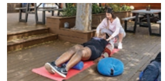
Back Cover: The Landing is a daytime wellness and respite center for pregnant and parenting youth and their children, located at St. Robert's Center and open Monday-Friday. Here, a volunteer leads a mother in guided yoga and meditation.