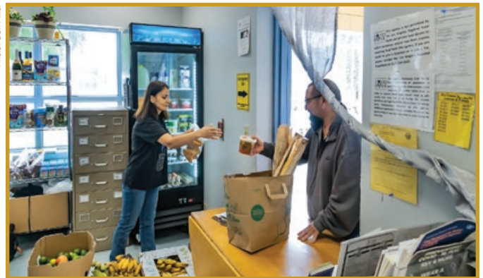
A volunteer assists a client with food distribution at Glendale Community Services Center. In addition to the Loaves & Fishes food pantry, the center provides emergency clothing, support groups, utility assistance, and case management in its Homeless Prevention Program.