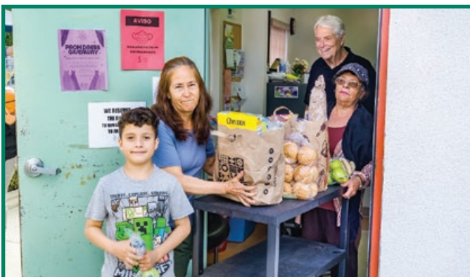
Clients of Guadalupe Community Services Center in Canoga Park receive food from volunteers at the food pantry. The center delivers food to people who are homebound and also has an OASIS (Older Adult Services Intervention System) program for seniors.