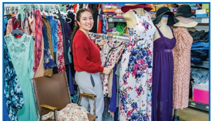
Angel's Corner, the thrift store at Guadalupe Community Services Center in Canoga Park, provides quality clothing and household items to clients at no cost, as well as low-cost furniture, clothing and household goods to the public.