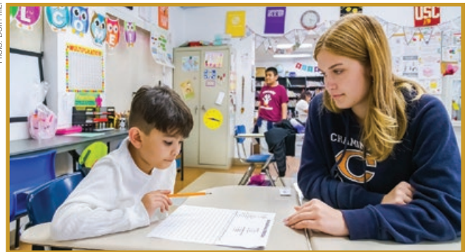
Students from Chaminade College Preparatory – High School volunteer as tutors for the children in the after-school program at Guadalupe Community Services Center in Canoga Park.