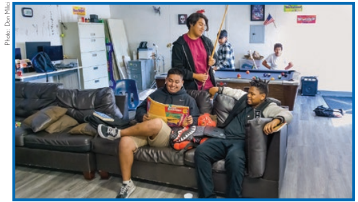
At El Santo Niño Community Center in South Los Angeles, some participants in the My Club program for middle and high school youth enjoy billiards while others are educating themselves about music. The program also provides job coaching for youth.