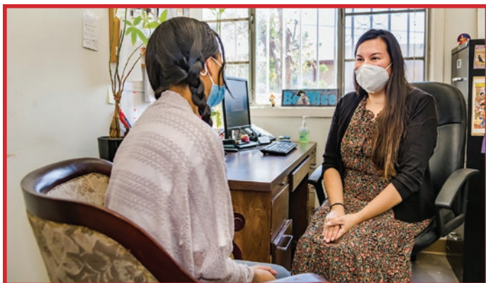
A Case Manager works with an Angel's Flight Shelter youth to develop an Individualized Service Plan. Services provided to the youth are in the areas of independent living skills, communication and education.