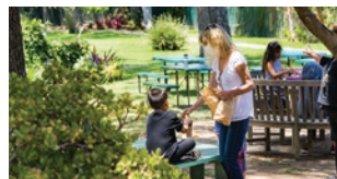
Front Cover: The grounds of Good Shepherd Shelter offer a peaceful, healing refuge for the resident mothers and children who were victims of domestic violence. Children enjoy a break from school to have their lunch.

All photos in this Annual Report, except where otherwise indicated, are by Don Milici.