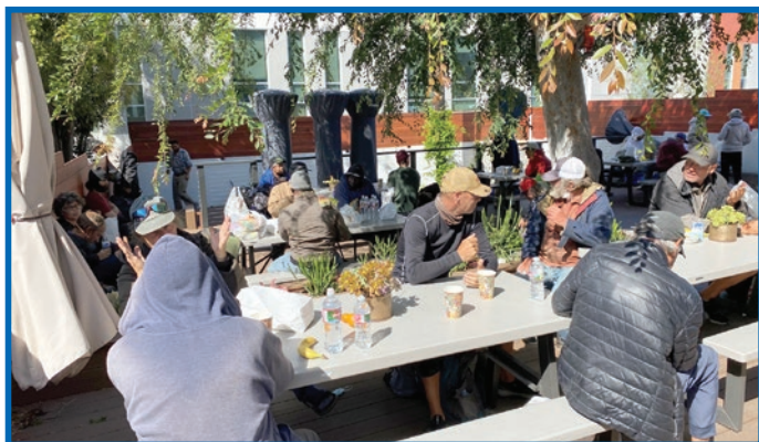
Saturday blessings at St. Robert's Center in Venice, where volunteers and unhoused neighbors enjoy connection and community in the renovated back yard. Volunteers provide continental breakfast, sack lunches, hygiene supplies, clothing and other donated items.