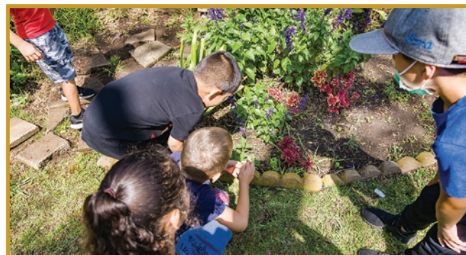
Children who are residents of Good Shepherd Shelter relax and enjoy the campus garden, a welcome respite from their previous experience with domestic violence.

At Catholic Charities of Los Angeles, we are very grateful to you, our generous supporters. You empowered us to Provide Help for our clients, with the physical necessities of food, clothing and shelter, to Create Hope in our clients for a better tomorrow, and to Enable Healing of our clients, emotionally, mentally, socially and spiritually, during FY 2021-2022.