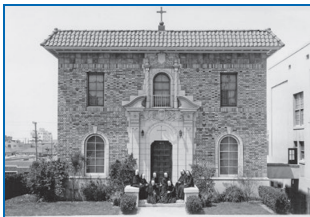
Original occupants of St. Clement's Convent in 1927, which has been Catholic Charities' St. Robert's Center since 1987, were Sisters of the Holy Names of Jesus and Mary.

Constructed and dedicated in 1927, St. Clement's Convent in Venice was occupied by the Sisters of the Holy Names of Jesus and Mary, who taught at St. Clement's Parish School from 1927 until June of 1969. After that time, the convent was used by various communities of Catholic Sisters who had ministries outside of St. Clement's Parish.