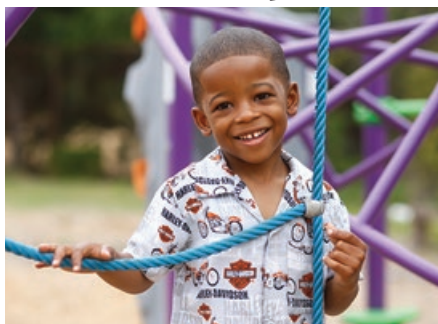
A young boy enjoys the playground at Elizabeth Ann Seton Residence in Catholic Charities' San Pedro Region.