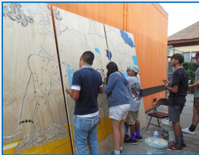
A large mural emphasizing education and sports is drawn in preparation for painting.