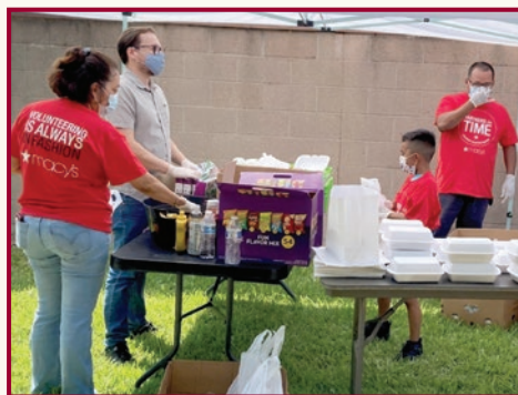
Macy's employees show that "Volunteering is always in fashion."