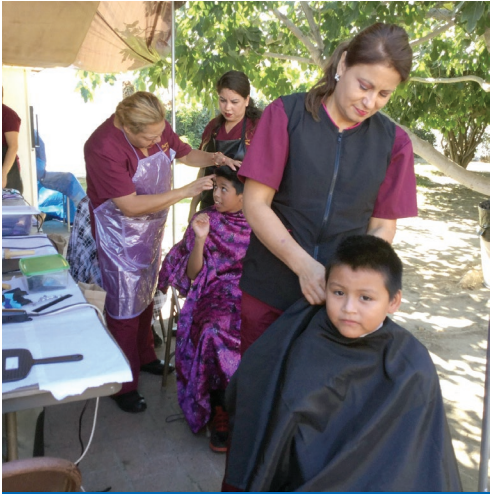
A young boy gets ready for his first day at school.

One mother of four children expressed gratitude for the event: "I want to thank you from the bottom of my heart! Times are tough and money is scarce. My husband is only working part time. So all the help