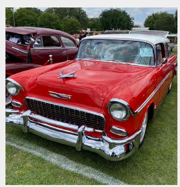
1955 Chevy Nomad. Winner of the car show.

The mission of JOBE Transitional Living Program is to create a trauma informed, culturally aware, and safe environment for our Transitional Aged Youth (TAY)/homeless youth to utilize their individual strengths to end the cycle of poverty and become pillars of the community.