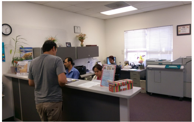
Refugees & Immigration Services