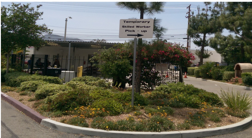
Temporary Skilled Worker Center