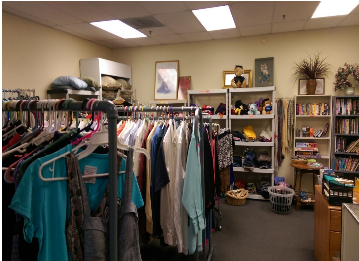
Clothing Distribution Center