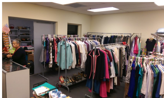
Thrift Store and clothing allocation center