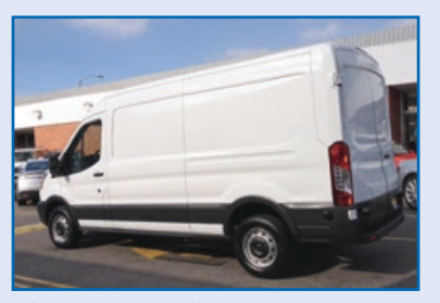
The new van will pick up supplemental groceries and donations for low income clients at St. Mary's Community Services Center.

Our Lady of the Angels Regional advisory board held its annual Spirit of Giving Celebration fundraising event at the Riviera Country Club. A live cash auction was held to raise funds to acquire a cargo van to replace the old