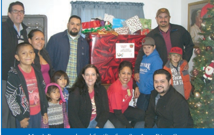
Macy's Partners adopted families from San Juan Diego Center.

Catholic Charities' staff were so pleased with the unexpected donations that came from various sources: blankets and warm jackets from Immaculate Conception Catholic parish in Monrovia; clothing, shoes, hygiene