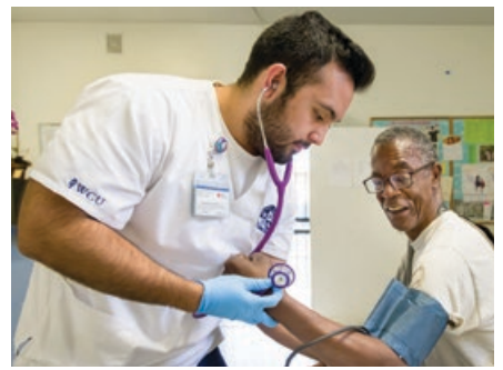
Last year, San Pedro Region's community centers and shelters provided 188,763 services to 6.540 clients.